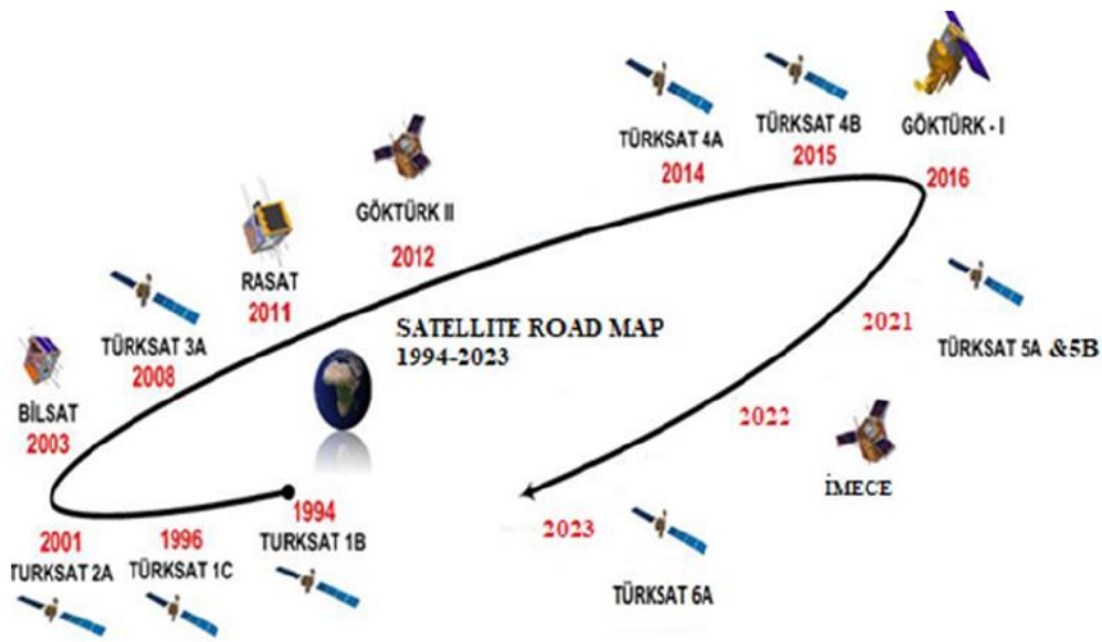
Figure 1. Satellite roadmap of Türkiye